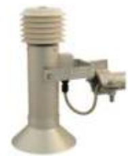
Ultrasonic snow depth sensor